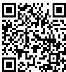
NRA Silhouette Rules